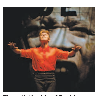
The artistic side of David Bowie is spotlighted in the film "Moonage Daydream."

Morgen, who calls himself an "intellectual midget" compared with Bowie, shares that